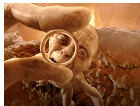
Tom Fanger @TFanger 5d @ChelmHockey 2's want to off load @OgrapsN due to spending more time finding the ring instead of the net pic.twitter.com/vY36gLBMJc